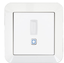
GIRA Standard 55